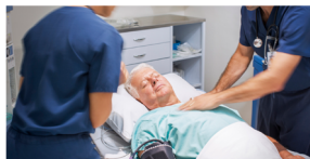
▶ Hospital Emergency Room