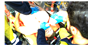
▶ EMS/First Responder Physician Consult