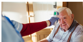
▶ Reducing Readmissions