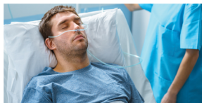
▶ Hospital Inpatient Care