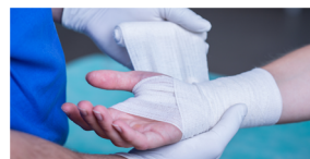
▶ Wound Care

A 200-bed hospital that implemented Hippo Virtual care in EMT, ER, OR and Inpatient discharges could save more than $10 million in annual costs.