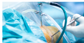
▶ Surgical Services Operating Room