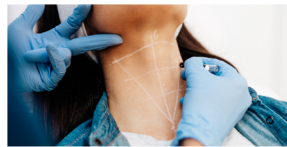
▶ Cosmetic Surgery