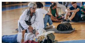
▶ Remote Clinic/ Disaster Relief